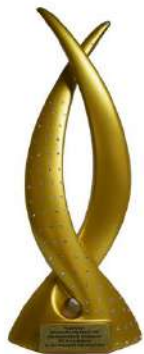
PropertyGuru Indonesia Property Awards 2021