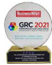
BusinessNews GRC Awards 2021