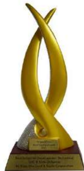
PropertyGuru Asia Property Awards (Indonesia) 2021