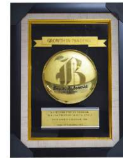
Bisnis Indonesia Awards 2021