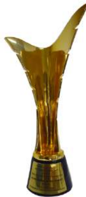
FIABCI - REI Awards 2021