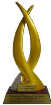
PropertyGuru Asia Property Awards (Indonesia) 2021