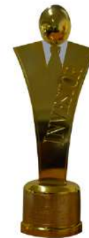
Investor Awards 2021