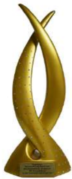
PropertyGuru Indonesia Property Awards 2021