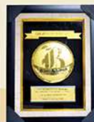
PropertyGuru Indonesia Property Awards