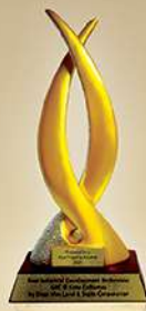
PropertyGuru Asia Property Awards