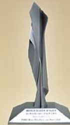
FIABCI World Prix d'Excellence Awards