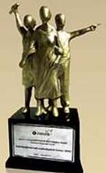
Bank Indonesia Awards